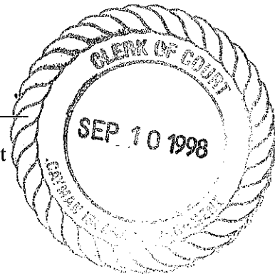
W.S. WALKER & COMPANY Attorneys-at-Law to the Applicant