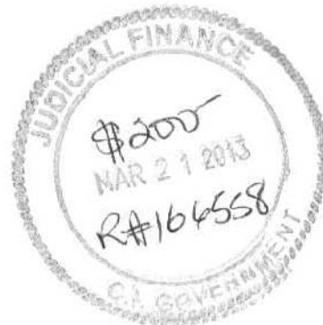
Harney Westwood & Riegels

A handwritten signature in cursive script, appearing to read "HWR", written over a horizontal line.